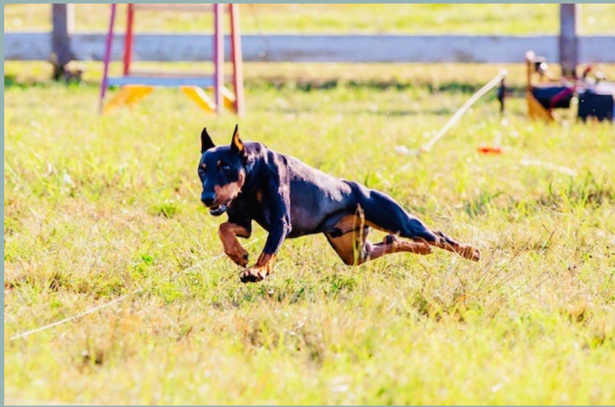
Little Dogs with Big Dreams